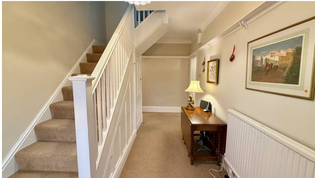
Plate rack, under stairs cloaks cupboard with light.

LOUNGE/ DINING ROOM 25'7" x 11'8" max (7.80m x 3.57m max )